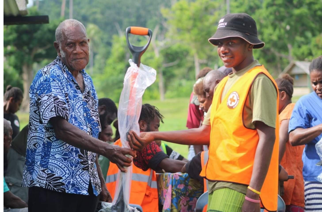
A villager from Malo island received his gardening tools