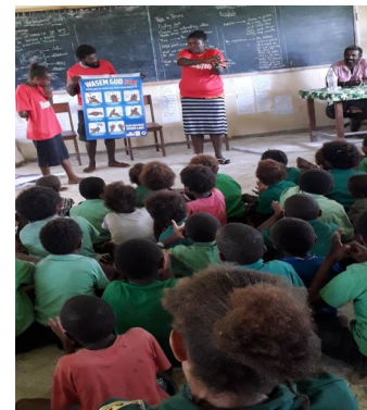
Handwashing demonstration for children at school