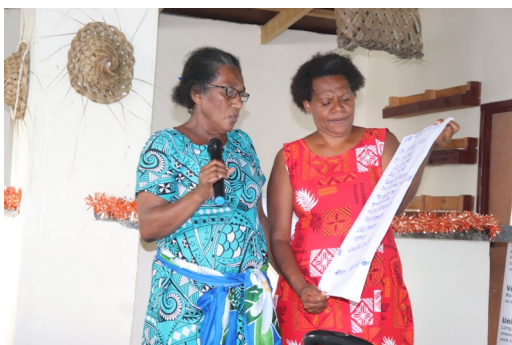
Group work activity presentation by staffs

In March, in collaboration with Solomon island Red Cross, 5 rescued Solomon islanders were assisted with hygiene kits and clothing. 5 men including a young boy of 15 years are from Reef Island from Temotu Province in Solomon Islands. Stranded in Port Vila for almost a month awaiting to be repatriated, they were able to be reconnected with their families through phones call services provided by VRCS.