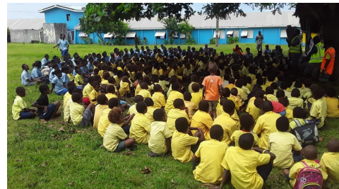
461 Children at Walla attending Covid19 awareness .