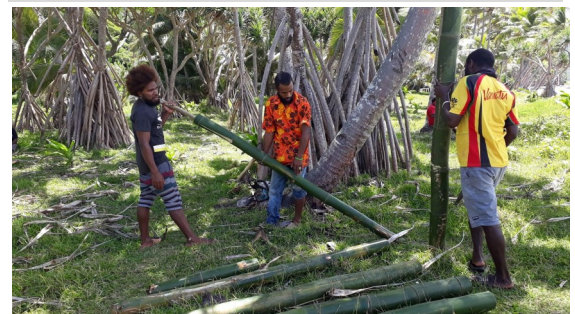
Volunteers cutting bamboos to build hand-