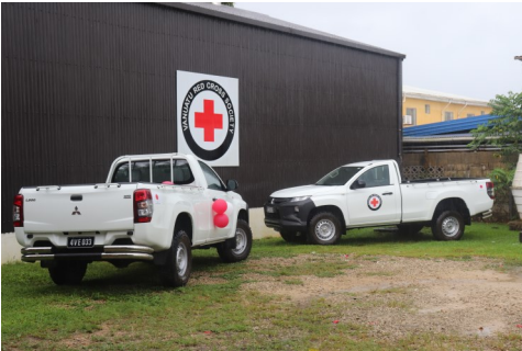
Vehicles donated by the Government

Another milestone for Branch developments when the Government of Japan in Vanuatu, under Japan's Grant Assistance for Grassroots Human Security Project (GJP) donated 2 vehicles to support Red Cross Branches of Sanma and Penama Provinces to boost the emergency response capabilities of VRCS for the benefit of communities.