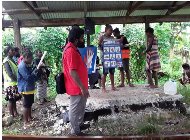
Volunteers raising Covid19 awareness at Banban