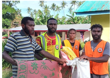
Distribution of Non Food Items to affected family