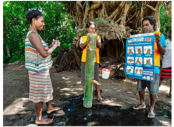
A Tannese mother learned the 8 steps on how to better wash hands

With the support of Qatar Red Cross, Disaster Response Emergency Fund (DREF), health Team were deployed in the 6 provincial outer islands to reach out to remote communities by educating them about the newly deadly diseases, and how people can protect themselves from getting the virus; the awareness was highlighted with emphasis on keeping the handwashing practices. As access to water is another identified challenge that varies from one island to another; however communities were encouraged to use existing and no cost local resources to support them in the establishment of handwashing stations build in main centres , across the country.