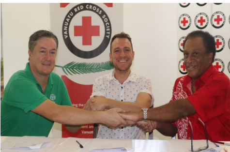
MOU signed between Save the Children,

Another milestone for Branch developments when the Government of Japan in Vanuatu, under Japan's Grant Assistance for Grassroots Human Security Project (GJP) donated 2 vehicles to support Red Cross Branches of Sanma and Penama Provinces to boost the emergency response capabilities of VRCS for the benefit of communities.