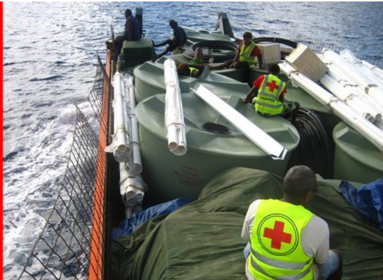
Rainwater tanks are transported to remote communities by boat

Mitigating the impact of disasters by coping with water challenges