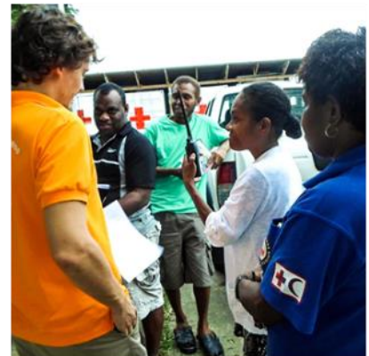
HF Radio Training