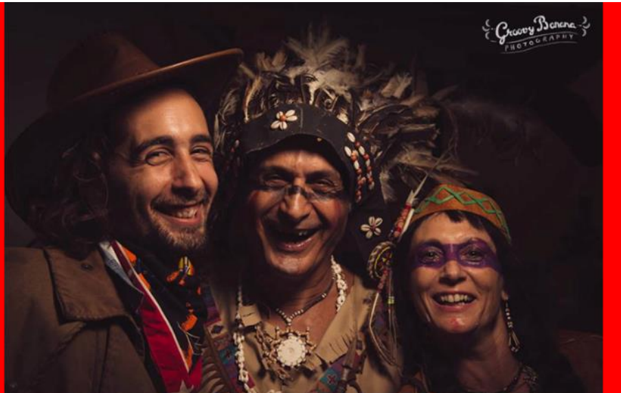
2014 VRCS Gala Night