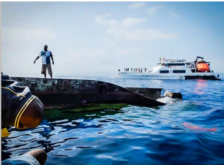
VRCS responds to the sinking of the MCY cargo ship off North Efate

On the morning of the 11 th July 2014, the Chairman of the Community Disaster Committee of Mangaliliu called the Red Cross Office to give the alert that the Marine Vessel MCY was in the process of sinking off the coast of North Efate.