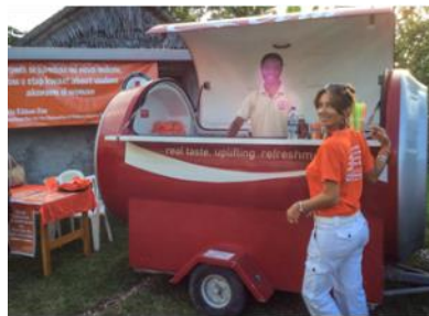
White Ribbon Day