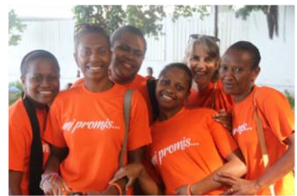
White Ribbon Day