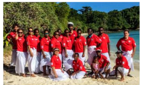
VRCS Christmas Party