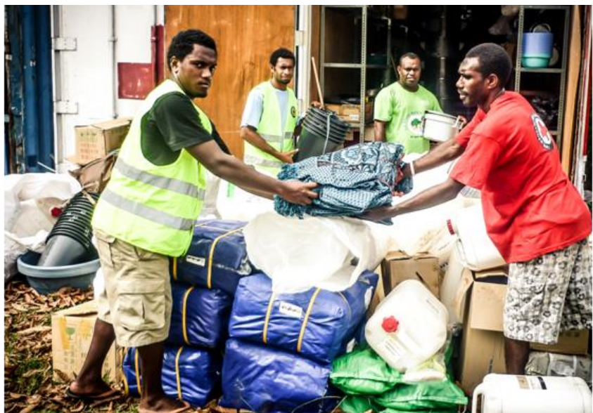
Stocktake of disaster relief supplies

undertook disaster risk reduction activities with a total of 13 communities reaching approximately 5,000 beneficiaries. In these communities, VRCS facilitated the creation of a Community Disaster Committee (CDC) and with the help of these committees a community response plan. Awareness activities were carried out with the entire community and simulation exercises were undertaken to make sure that everyone knows what to do when a disaster strikes.