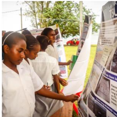
World DRR Day