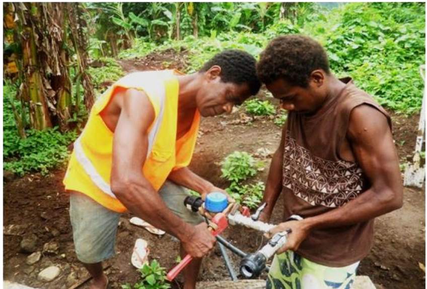
Installation of the water meter

Proper maintenance of these systems is vital to ensure their sustainability, so VRCS/ FRC conducted training in all