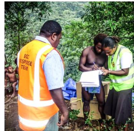
Distribution of relief supplies

an assessment of the damage. VRCS reached some of the most remote villages in Vanuatu to check on their inhabitants. In total, VRCS distributed relief to 57 of the worst affected households, reaching close to 300 people.