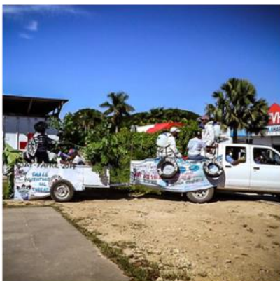
World Health Day