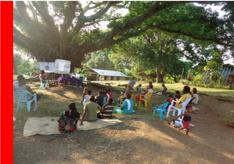
Awareness session in Isini village, Tanna

The Law and Fundamental Principles (LFP) project is an ongoing program funded by the ICRC.