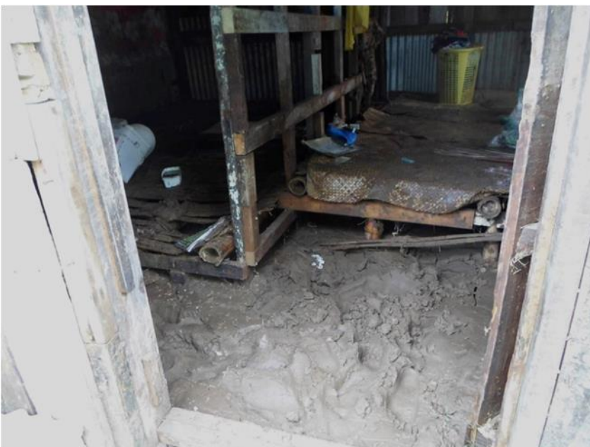
Damage caused by flooding in Prima on the outskirts of Port Vila

The team performed needs assessments and distributed relief supplies such as cooking equipment, tarpaulins and