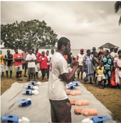
World First Aid Day