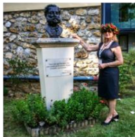
VRCS in France