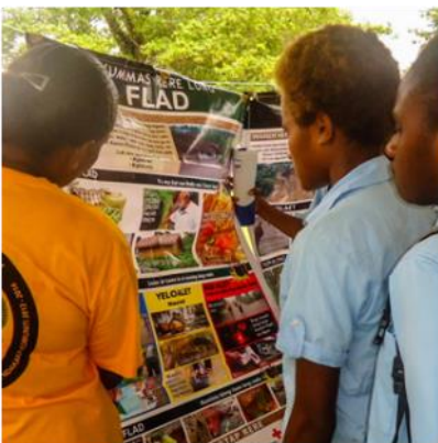
World DRR Day