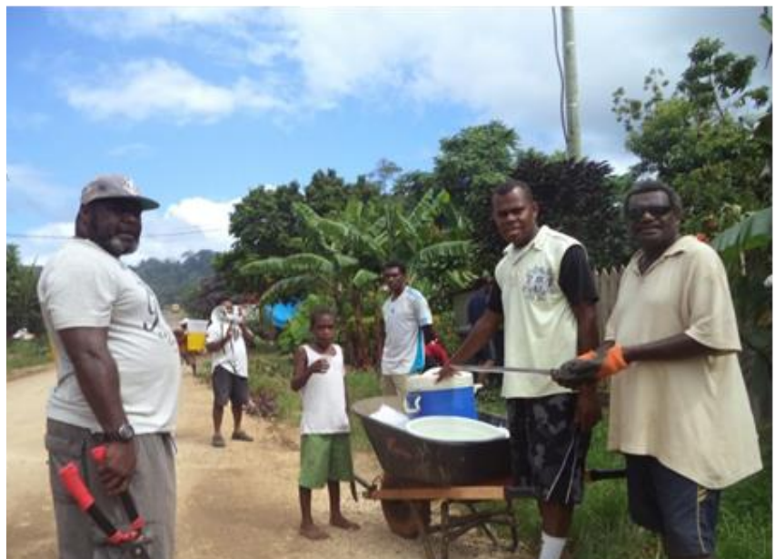
Community members clean up to remove mosquito-breeding sites

"Over 6000 people benefited from this campaign and the Dengue outbreak eased substantially following these activities"