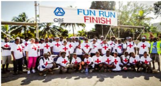
QBE Fun Run