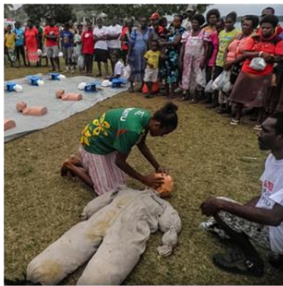
World First Aid Day