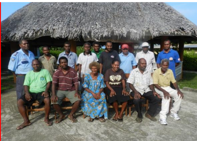
New branch members in Penama Province

An exciting new development for the branches occurred later in the year when the President and the Communications Coordinator toured all of the provincial branches as part of the Strengthening Provincial Partnership Project.