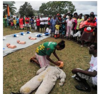
World First Aid Day

10 new community-based first aid trainers