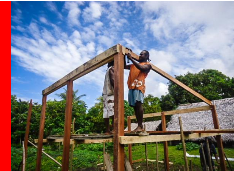
Water Tank Installation

The 24-month P2HK program finished up in 2014. Funded by the Australian Red Cross, P2HK installed water tanks and latrines in communities in West Ambrym.