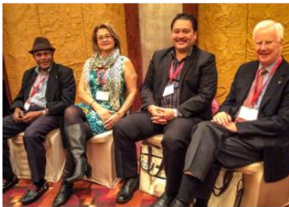
VRCS in Beijing