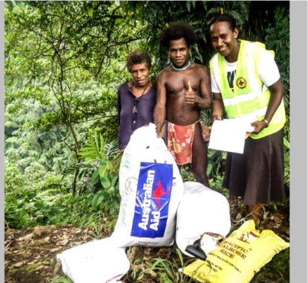
Distribution of relief supplies in remote Santo communities

In March 2014, Cyclone Lusi made its way through the middle of the northern islands of Vanuatu. The category-2 storm caused damage to houses and crops affecting approximately 20,000 people.