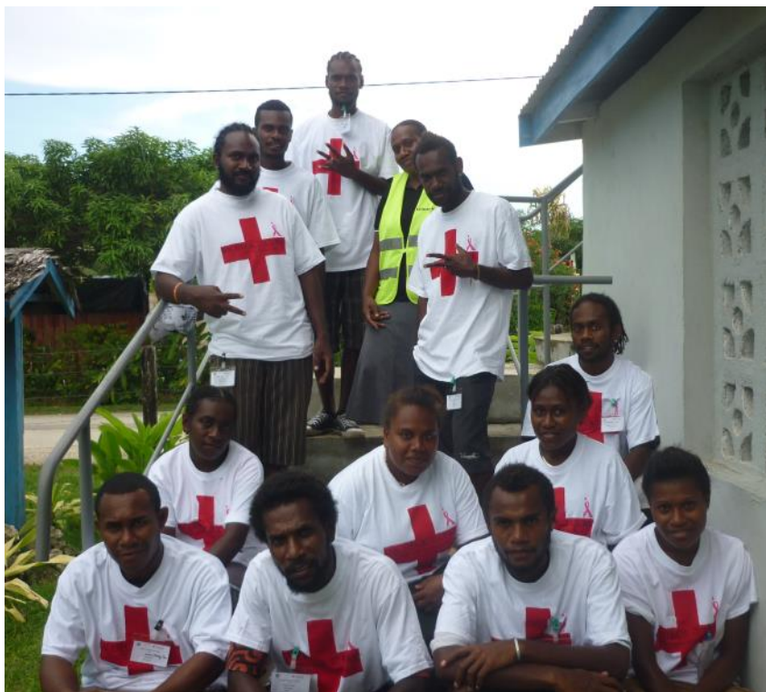
ERT Training in the provinces