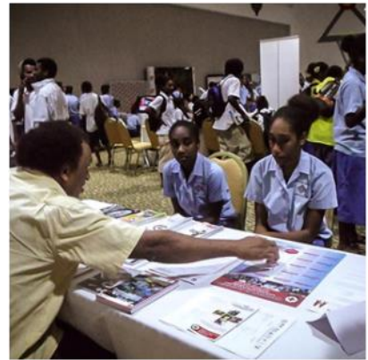
Student Career Day