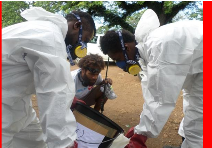
VRCS volunteers prepare to spray outside areas in communities affected by Dengue Fever

Early in the year there was a large outbreak of Dengue fever in Port Vila, the mosquito-borne illness that causes severe flu-like symptoms and, in some cases, even death.