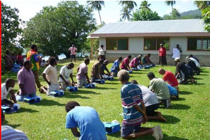
Public Works employees undergo basic First Aid Training

The commercial first aid program had a very strong year in 2014 with the team training 348 people in first aid. The program, funded by New Zealand Red Cross, hired a VQA registered First Aid Officer who was successful in securing some major clients. This included Unelco and the Public Works department, who used VRCS in their Occupational Health and Safety trainings across four islands. The program was assisted by an Australian Red Cross AV-ID volunteer who worked alongside the team for the year.